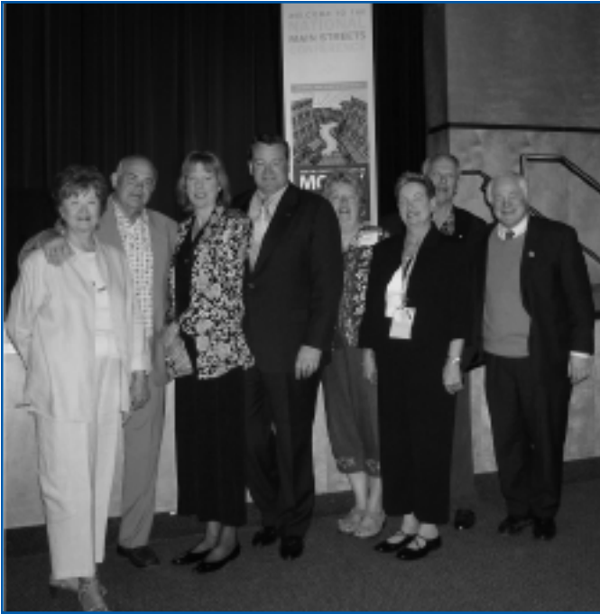
Preservationists in Burlington, Iowa (a Great American Main Street Award winner) used the opportunity at the Main Streets Conference to strengthen their relationship with Congressman Jim Leach (R-Iowa). They interacted with him throughout his time at the conference and invited him to accept their Great American Main Street award with them.

preservation movement by engaging new audiences. People are more likely to become involved in preservation when they are aware that advocating on behalf of a specific issue will have a positive impact on the quality of life in their community. A grassroots network that can be counted on for quick action is also helpful when potential threats arise to historic and cultural resources. Finally, developing a grassroots network empowers people by helping to exercise their voice in the political process.